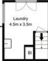
Ground Floor Approx Floor Area 21.2 Sqm