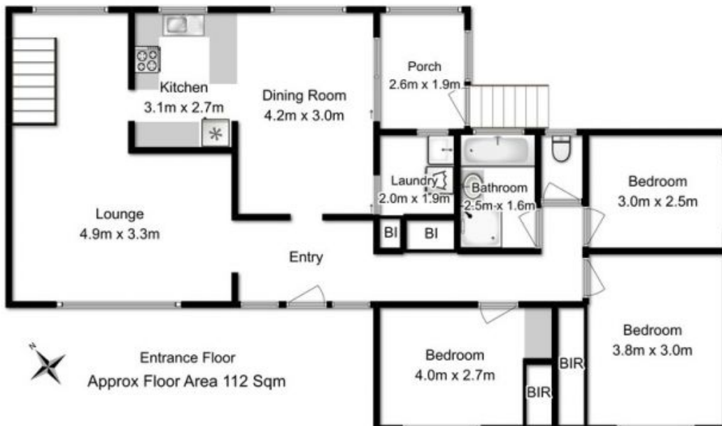
Entrance Floor Approx Floor Area 112 Sqm

Fixtures And Fittings are for display only, not to scale. This floor plan is a sketch, dimensions are approximate. Produced by open2view.com