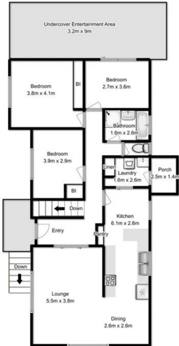
Upstairs Floor Area Approx: 118m 2