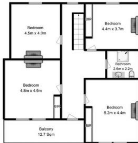
1st Floor Approx Floor Area 106.5 Sqm