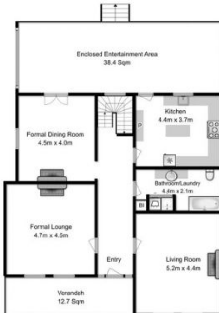
Ground Floor Approx Floor Area 106.5 Sqm