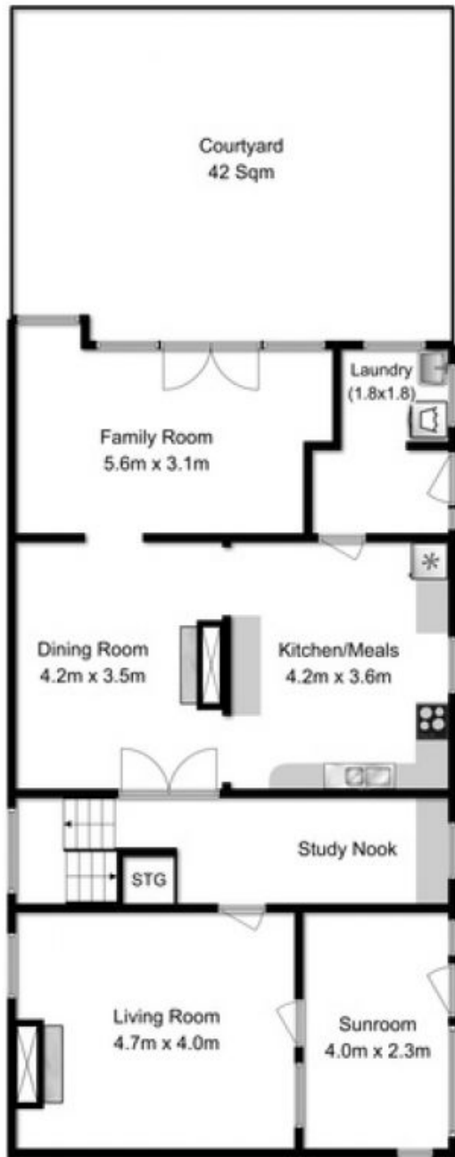
Ground Floor Approx Floor Area 100 Sqm