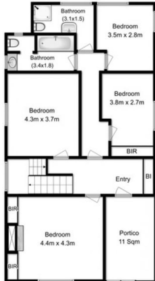
Entrance Floor Approx Floor Area 95 Sqm