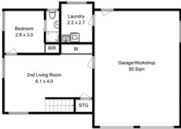
Ground Floor Approx Floor Area 48 Sqm