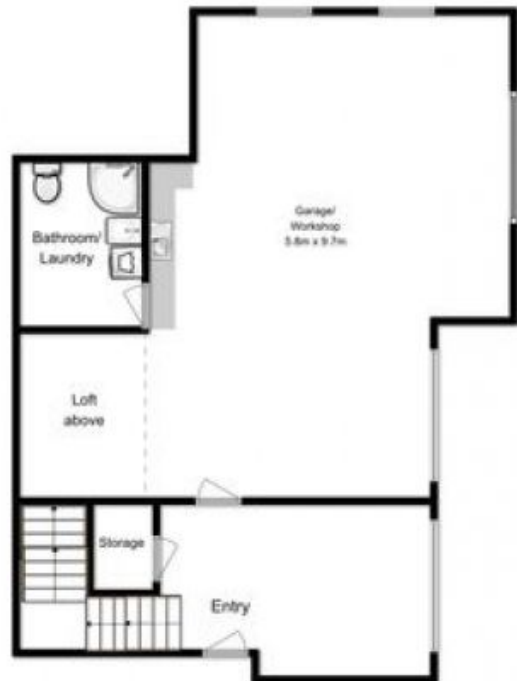
Lower Level floor area 118sqm