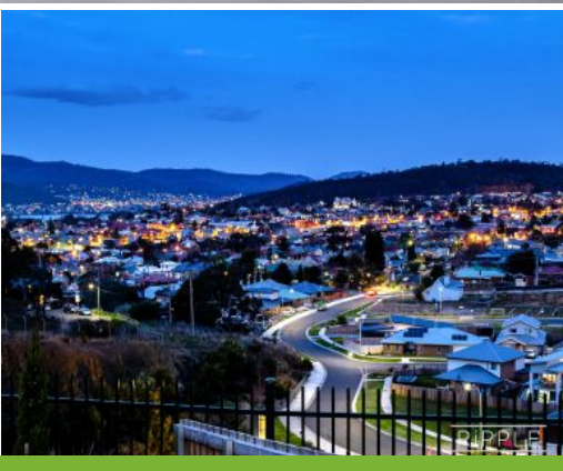
35 William Cooper Drive NEW TOWN, TAS