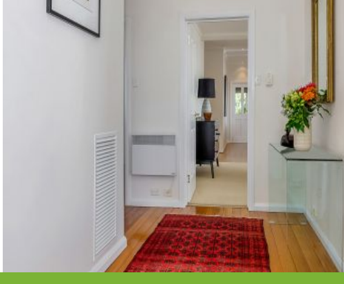
101A Arthur Street WEST HOBART, TAS